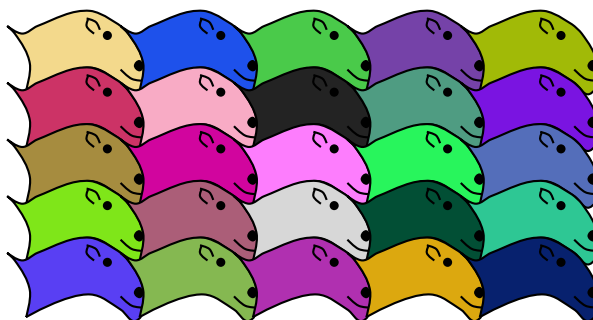
Figure 3: Color series — pstricks example 3

\newcommand*\SheepHead {\begin{pspicture}(3,1.5) \pscustom[liftpen=2,fillstyle=solid,fillcolor=sheep!!+]{% \pscurve(0.5,-0.2)(0.6,0.5)(0.2,1.3)(0,1.5)(0,1.5) (0.4,1.3)(0.8,1.5)(2.2,1.9)(3,1.5)(3,1.5)(3.2,1.3) (3.6,0.5)(3.4,-0.3)(3,0)(2.2,0.4)(0.5,-0.2)} \pscircle*(2.65,1.25){0.12\psunit}% Eye \psccurve*(3.5,0.3)(3.35,0.45)(3.5,0.6)(3.6,0.4)% Muzzle % Mouth \pscurve(3,0.35)(3.3,0.1)(3.6,0.05) % Ear \pscurve(2.3,1.3)(2.1,1.5)(2.15,1.7) \pscurve(2.1,1.7)(2.35,1.6)(2.45,1.4) \end{pspicture}} \newcommand*\Sheep {\SheepHead\SheepHead\SheepHead\SheepHead\SheepHead} \definecolorseries{sheep}{rgb}{step}{rgb}{.95,.85,.55}{.17,.47,.37} \resetcolorseries{sheep} \psset{unit=0.5} \begin{pspicture}(-8,-1.5)(8.5,7.5) \rput(0,6){\Sheep} \rput(0,4.5){\Sheep} \rput(0,3){\Sheep} \rput(0,1.5){\Sheep} \rput(0,0){\Sheep} \end{pspicture}